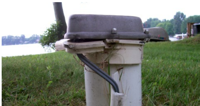
Damaged wellhead with cracked well cap and exposed wires